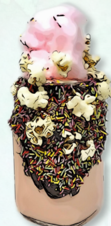
STRAWBERRY BUBBLEGUM, POPCORN & CANDYFLOSS