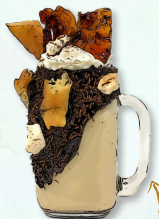
PEANUT BUTTER, BANANA, CANDIED BACON & CHURROS

Have your cake and drink it! With our new freakshakes ...Starting with our Vanilla based milkshake adding some crazy ingredients and finished off with whipped cream . There is definitely nothing vanilla about them!