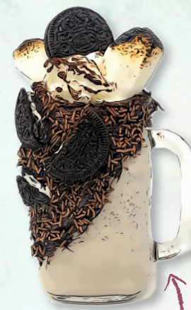
OREO, NUTELLA & TOASTED MARSHMALLOW